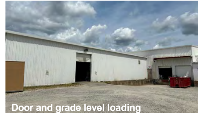
Door and grade level loading